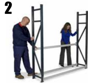
2 Click the remaining beams into place and attach the safety pins