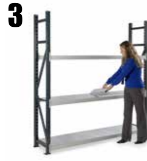
3 Drop in the steel or chipboard shelves