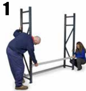
1 Position a pair of frames. Hold them in place with a pair of beams

The system allows you to easily adjust your configuration and shelf heights as your stock changes.